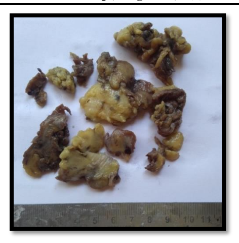
Fig-3: Gross specimen cconsist of multiple grey-white to membrane soft tissue masses