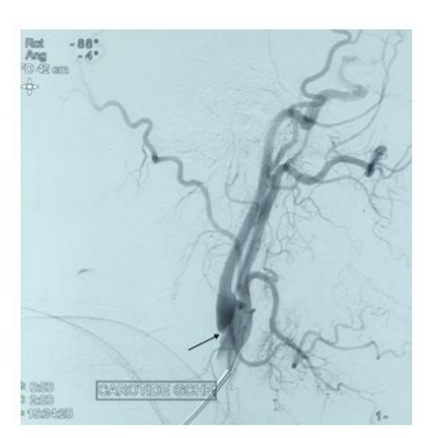
Fig-4: digital subtraction angiography showing a non-stenosing carotid diaphragm associative to a blood stagnation in the spur formed by the diaphragm and the wall of the artery (black arrow)

Fig-3: Angio CT demonstrating a non stenosing substraction image of the posterior wall of the carotid (black arrow)