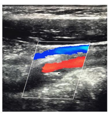
Fig-2: Color duplex ultrasound demonstrated a diaphragm (black arrow) in the left CCA

Fig-1 : Cerebral scan showing a large infarction in the territory of the left middle cerebral artery