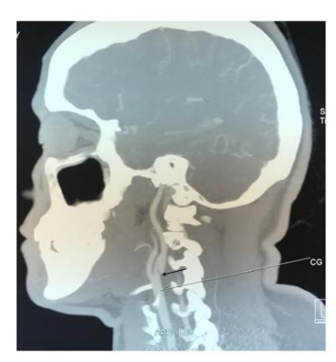
Fig-3: Angio CT demonstrating a non stenosing substraction image of the posterior wall of the carotid (black arrow)

Fig-2: Color duplex ultrasound demonstrated a diaphragm (black arrow) in the left CCA