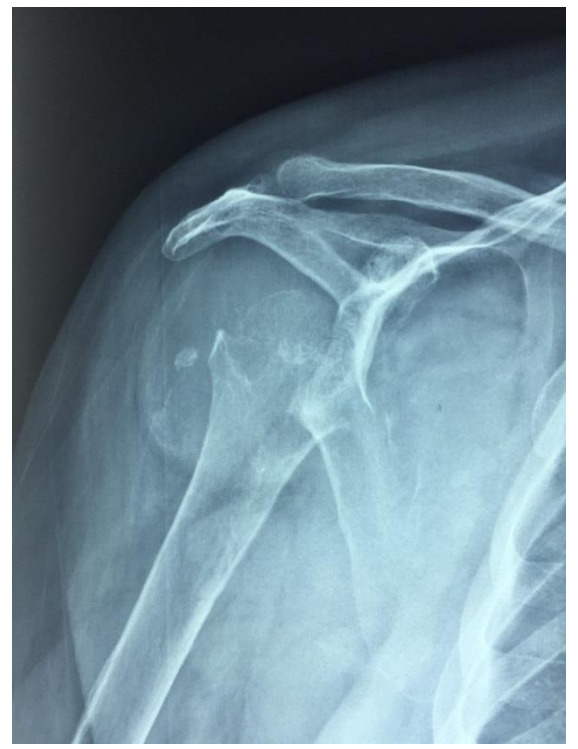
Fig-1: X-ray of the right shoulder showing the lesion