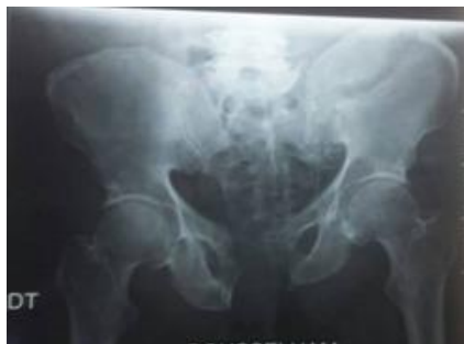
Fig-1: X rays of the pelvis shows condensation of left sacroiliac joint margins with ascension of the left hemipelvis and a pathological fracture of the iliac wing