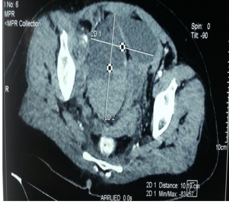
Fig-1: Cross section showing a retroperitoneal hematoma