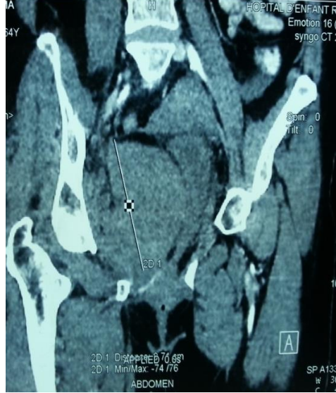
Fig-2: Sagittal section showing retroperitoneal hematoma