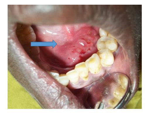
Fig-6: control at 15 days