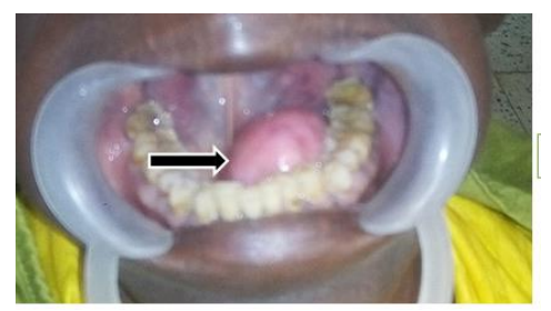
Fig-1: intraoral view showing the tumour of the oral floor

mesenchymal proliferation. The result was a fibrolipoma (Figure 7). The control at 6 months had shown an absence of recurrences and no alteration of the anatomical structures of the neighbourhood was noted (figure 8).