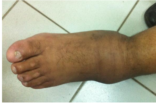
Fig-1: Clinical appearance of a talonavicular dislocation with medial displacement of the foot on the head of talus with mild edema