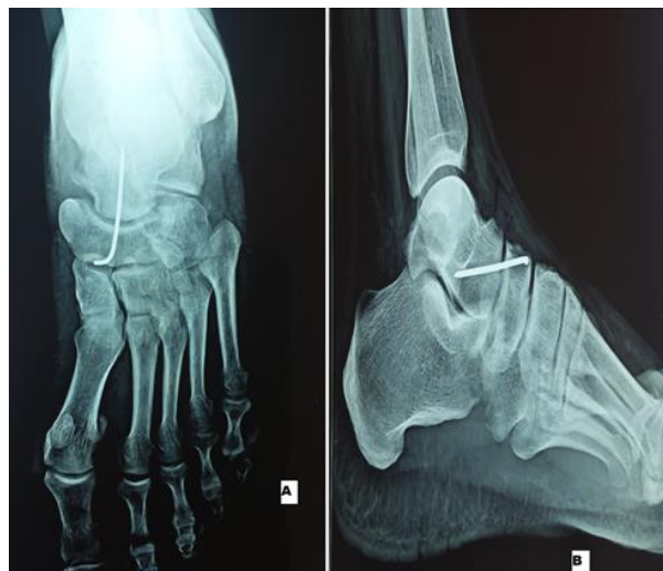
Fig-3(A,B): anteroposterior and lateral views after closed reduction and percutaneous fixation with wire of medial talonavicular dislocation