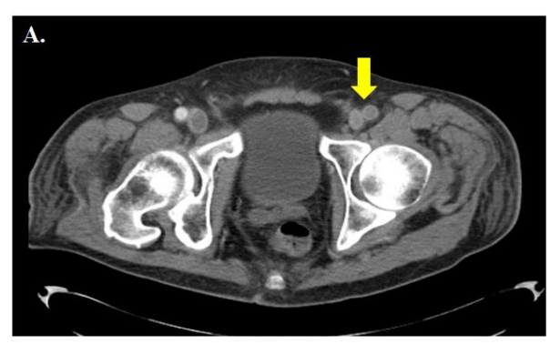
Image A: CT abdomen and pelvis with intravenous contrast showing filling defect involving the left external iliac artery indicating thrombus