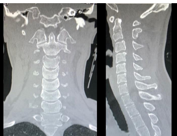
Fig-2: Cervical computed tomography (CT) findings on arrival. CT revealed spur formation at the superior posterior margin of the C4 vertebral body

Fig-1: Schematic illustration of the Beach Flags plays style. The patient in the present case was attempting to grab a flag stuck into the sand by jumping and extending his upper extremities while over-extending his neck (arrow)