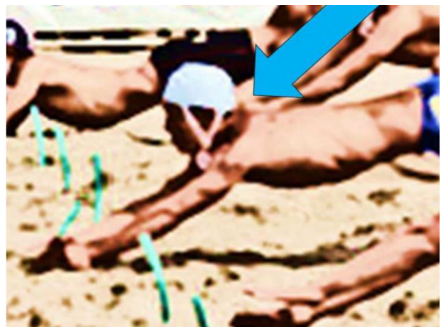
Fig-1: Schematic illustration of the Beach Flags plays style. The patient in the present case was attempting to grab a flag stuck into the sand by jumping and extending his upper extremities while over-extending his neck (arrow)