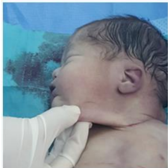
Fig-5, 6 and 7: Image of the NN with a thin, flaccid and wrinkled aspect of the skin with empty purses