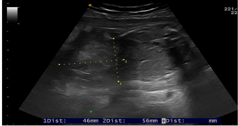
Fig-3, 4, 5: Ultrasound and color Doppler images in favor of agenesis of right abdomen muscles