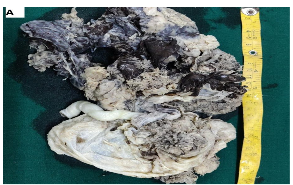
Fig-1: Gross appearence of placenta

H&E stained section shows lining of chorinoic villi with trophoblastic cells. In the stroma of villi, there is proliferation of plenty of capillaries, many of them are filled with blood and many are showing endothelial cell proliferation. Findings are in favour of TUMOR OF PLACENTA -VILLOUS ORIGIN -CHORIOANGIOMA" (Figure-2).