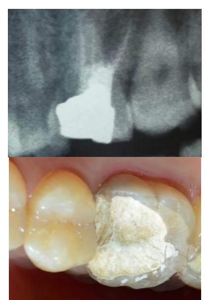
Fig-1: Initial clinical and radiographic examination

We used "Variolink esthetic<sup>®</sup>" which is an esthetic light and dual curing luting composite. It was important to respect manufacturer's recommendations. The final restoration is shown in Figure-6.