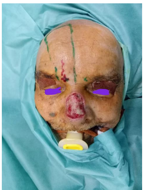
Nasal defect after excision and flap drawing