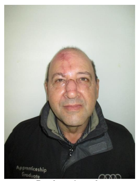
Results at 6 months