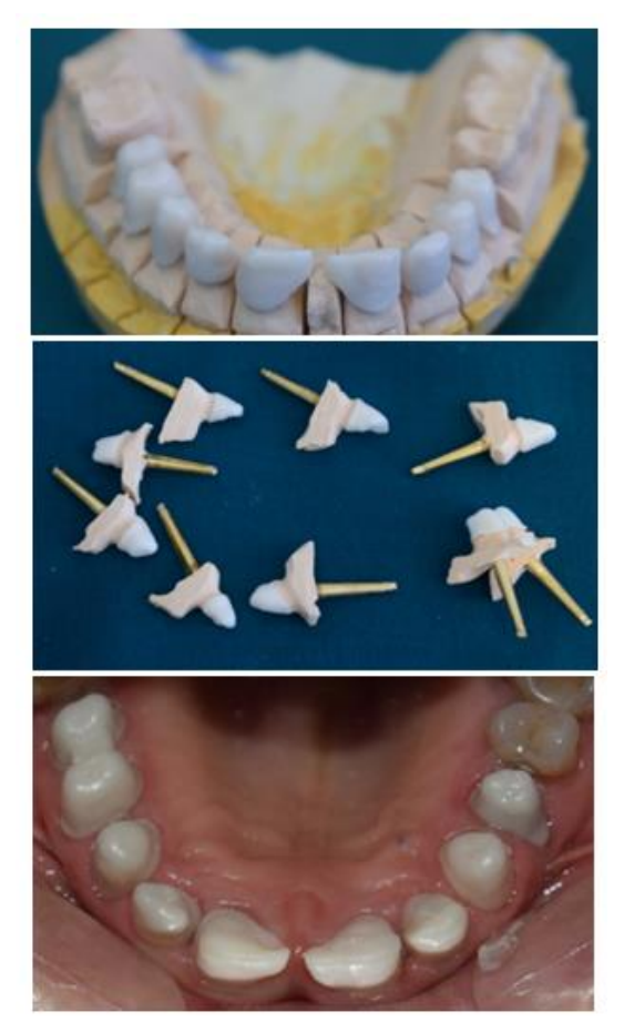
Fig-4(a,b,c): Zirconia frameworks

Finaly, esthetic and occlusion relationship were checked and the crowns were cemented after ceramic glazing (Figures 5,6).