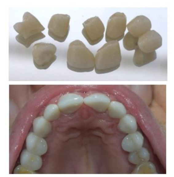
Fig-5: Final restorations

opacity in case of severe discoloration or of abutments restored by metal post and core as in our case .Also they are suitable alternative to cover remainder implant components.