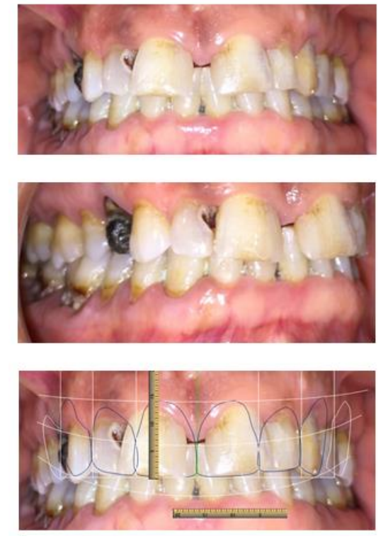
Fig-1: Intra oral views of initial situation (a,b)and Aesthetic planning(c)

In the other hand, to be able to cover the entire discolored abutment, the preparation should be extended in the sulcus .That's why, zirconia was probably, the best used in such a clinical situation without compromising the value of the definitive result.