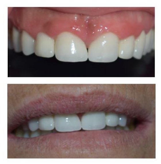
Fig-6(a-b-c): Final result

One of the others advantages of zirconia CAD-CAM crowns is the option for clinician to use conventional luting agents without compromising the strength or the shade of the restoration and to be able to realize intra-sulcular margins[8].