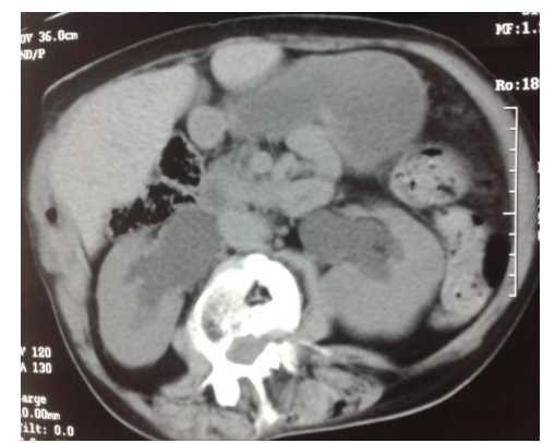
Fig-3: Pelvic abdominal CT in axial section showing bilateral ureterohydrosis

The CT carried out also made it possible to study the impact on the high urinary tract apparatus by revealing a bilateral ureterohydronephrosis [Fig.3], and to make the extension assessment by looking for other localization, the latter proved negative.