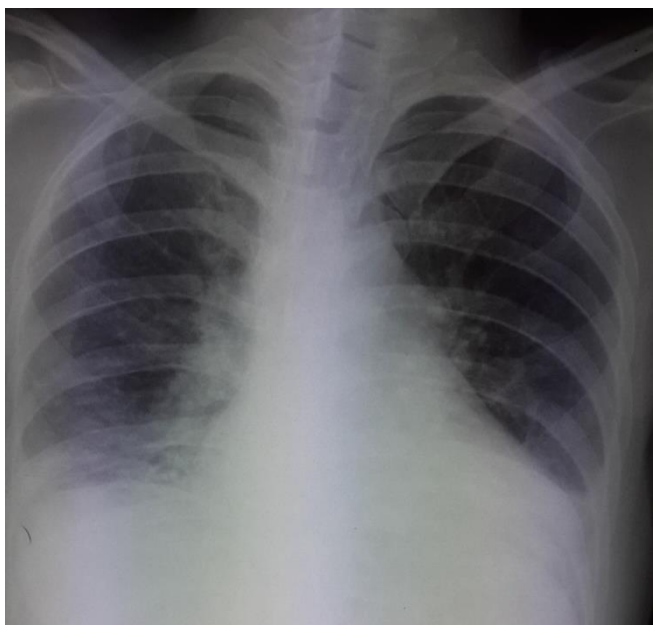
Fig-1: the chest X-ray showing interstitial syndrome

The patient was initiated on Cyclophosphamide pulse, which resulted in improved muscle strength and exercise tolerance during her hospital admission. She was initiated on guidelinebased heart failure management, including angiotensinconverting enzyme inhibitor (ACE-I) and aldosterone antagonist therapies; beta-blocker therapy was initiated before discharge. Patient was discharged on 20th day with no symptoms and improved muscle power and was advised to continue monthly cyclophosphamide and oral prednisolone. She was on regular follow-up with gradual tapering of the steroid. Eight months later, she presented with palpitations. ECG showed atrial flutter reduced with successful electrical cardioversion. Now, at 21 months of follow-up, the patient improved clinically, LVEF improved to of 40%-45%, and pulmonary pressure to 40 mmhg.