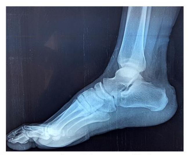
Fig 4: Postoperative radiograph after resection of the bone outgrowth of the postero-superior angle of the calcaneum