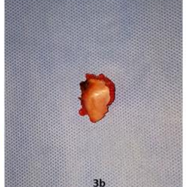
Fig 3a: postero medial approach of the ankle Fig 3b: Resected bone proeminence of the calcaneum