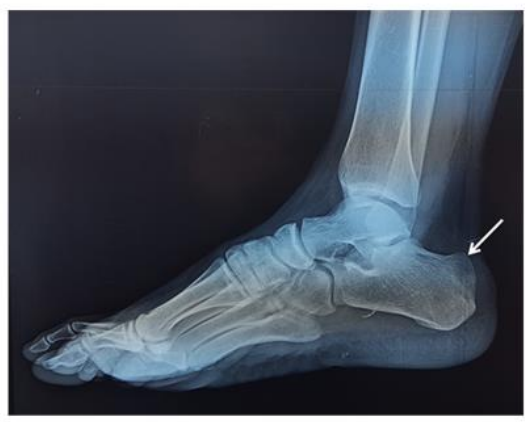
Fig 2: Lateral radiograph of the right foot showing an proeminence of the postero superior angle of calcaneous (white arrow)

The patient was admitted to the operating room, under spinal anesthesia, by the para-achilles postero-medial approach of the right ankle, we went to the anterior face of achilles tendon and we have discovered bone prominence of the postero-superior angle of the calcaneum coming into conflict with the