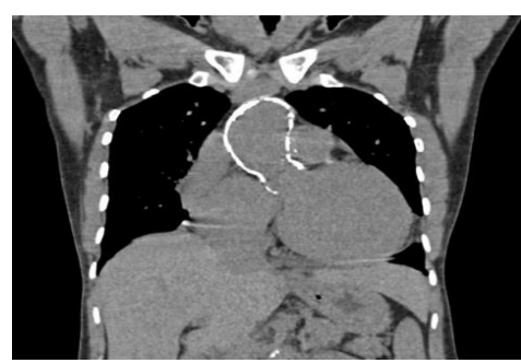
Fig-2: Image showing involvement of ascending aortic segment in computed tomography scan Management

As per ACR criteria [3], she was diagnosed to have Takayasu's arteritis and given supportive treatment with diuretics, ACE inhibitors, low dose corticosteroids following which her condition improved. Ethical committee permission was taken to use the case details for academic and research purposes