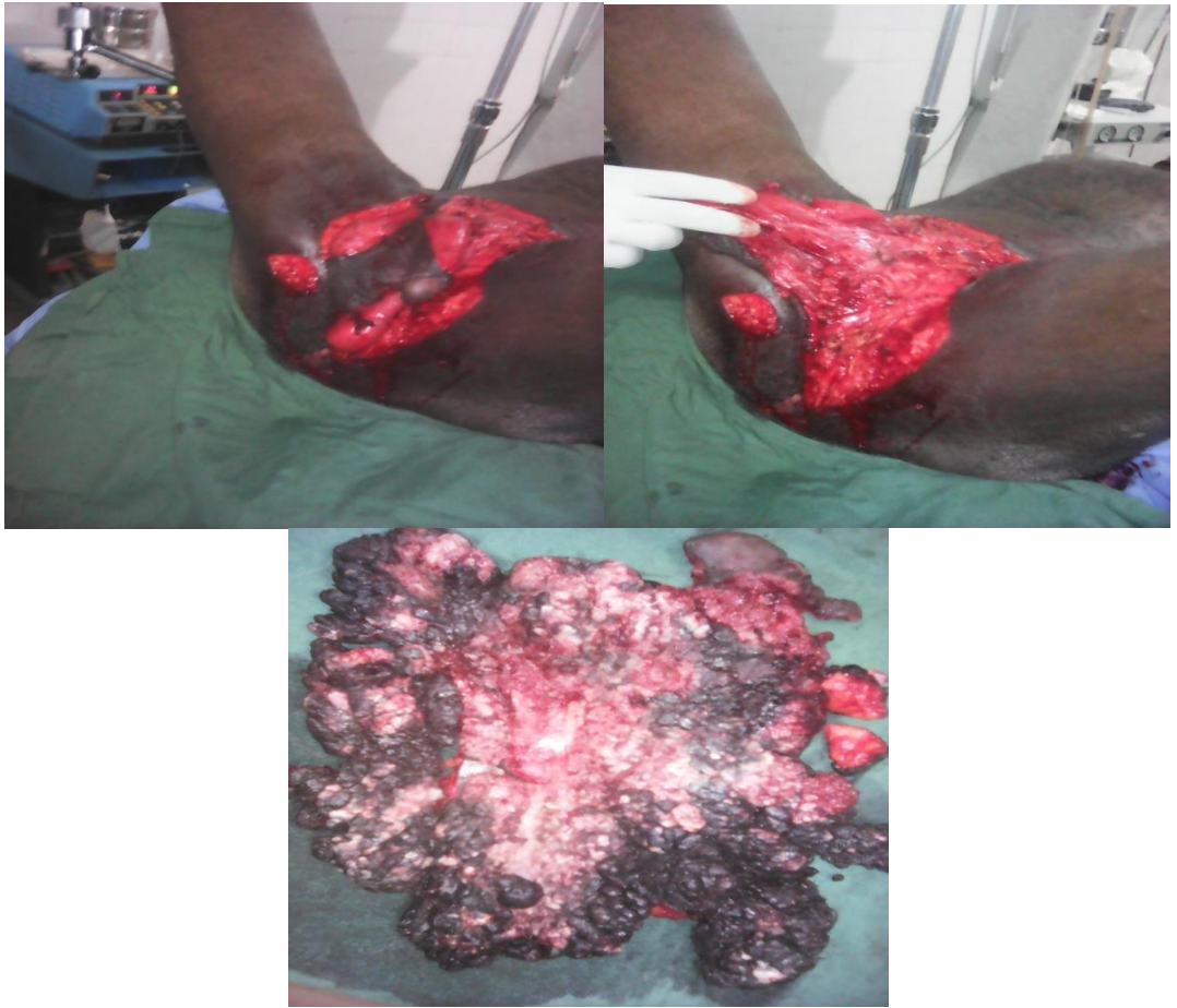
Fig-2: Complete and block surgical resection of the tumor

The treatment undertaken was a complete surgical resection in blockage of the tumor (Figure 2) and then the resulting area was repaired with hypogastrium skin flaps, groin and scrotal flaps. Drains were placed and removed twenty-four hours after, and a bladder probe was removed after 10 days (Figure 3).