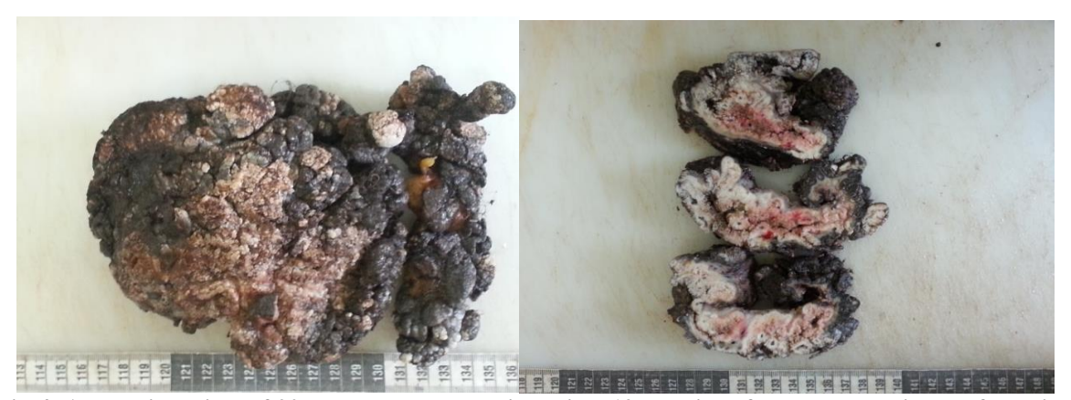
Fig-4: Anatomical piece of 20cm approx. large axis against 12 cm wide after a small shrinkage following preservation

acanthosis, hyperkeratosis, hyper papillomatosis, and koïlocytaires cells without atypia. The chorion was infiltrated by a few inflammatory cells.