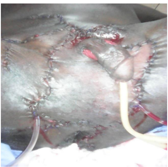
Fig-3: Resulting area of the resection repaired with skin flaps hypo gastric, Inguinal fold and the Scrotum. Drains were placed and removed twenty four hours later as well as a bladder probe that was removed days later

The pathologically examination shows from the macroscopic point of view a piece of about 20cm of large axis against 12 cm wide (Figure 4). While the histological study objectively examined hyper