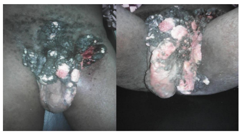
Fig-1: Tumor occupying part of the hypogastrium, pubis, and inguinal folds; the penis is totally covered and invisible at simple sight. The tumor to the appearance of vegetation in grape clusters or cauliflower, whitish, and friable by location; Ulcerated with blood-purulent and foul secretion in groin and femoral region on left

Examination of the inguinal folds had noted adenopathies. Serology of the human immunodeficiency virus was negative and the other results of the pre-operative assessment were uncharacteristic.