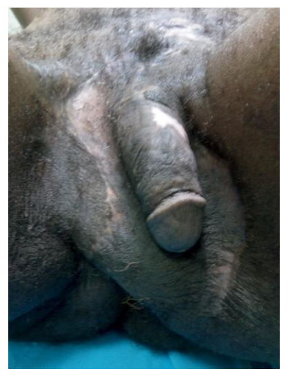
Fig-6: After one year and half of observation no recurrence is observed