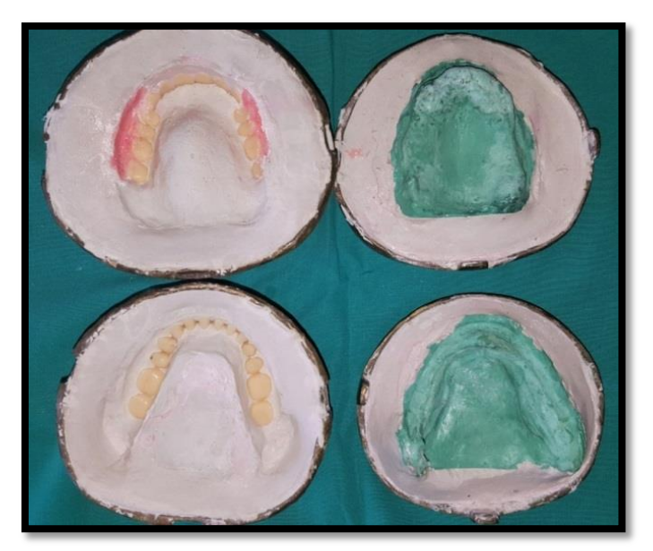
Fig-4: Dewaxing for final denture

The resultant mould space was then packed with heatpolymerizing acrylic material (fig 4).