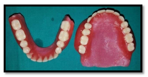
Fig-2: waxed up trial denture with buccal extensions

obtained primary casts. Border molding was carried out using soft green tracing sticks after checking the tray extension. A wash impression was made with zinc oxide eugenol impression paste. The obtained impressions were beaded using beading wax and boxed in the regular manner. Secondary casts were poured using type 2 dental stone and used to fabricate denture base and occlusal rims. The patient's jaw relations were recorded and a trial was carried out in order to check the occlusion & aesthetics. During the trial, a template for the cheek plumper was fabricated using modeling wax (fig 2).