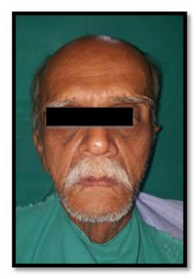
Fig-1: extra oral photograph

The patient was consciously concerned about his aesthetics. So keeping in mind the requests and demand of the patient, a treatment plan was formulated. It was decided to give the patient a conventional complete denture with an undetachable cheek plumper which was attached to the maxillary and mandibular denture.