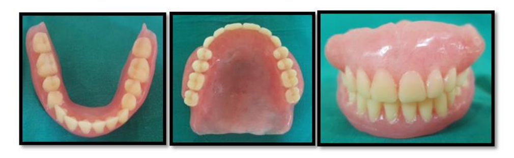
Fig-6: finished and polished final denture

plumpers were retrieved. Trimming, finishing, and polishing procedures were performed (fig 6).