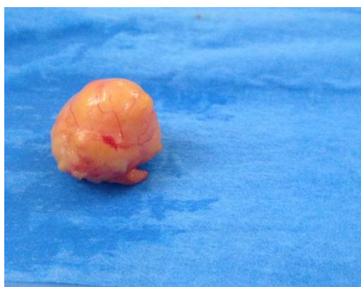
Fig-3: Image of the operative piece