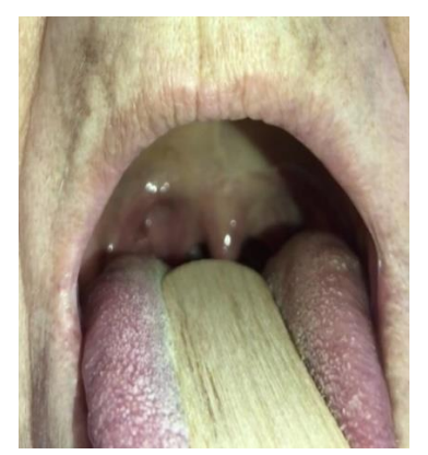
Fig-2: Evolution of the right tonsillar lymphoma after chemotherapy

Treatment with R-CHOP chemotherapy led to obtain a clinical complete response (figure 2) and a metabolic complete remission after 3 cycles (figure 3), a total of 6 cycles was administred. During follow-up, she remains disease-free exceeding one year.