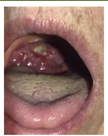
Fig-1: Tonsillar lymphoma on the right

The results of laboratory analyses obtained on admission were as follows: white cell count: 5828/ul; hemoglobin: 15.02 g/dl; platelet count: 233000/ul; lactate dehydrogenase: 202 u/l; blood urea nitrogen: 0,24 g/l; creatinine: 6,14 mg/l; aspartate aminotransferase: 22 IU/l; alanine aminotrasferase: 20 IU/l.