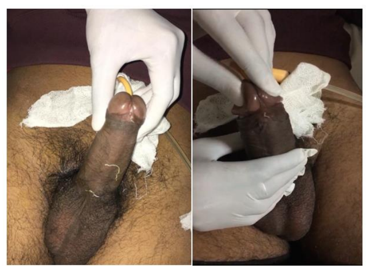
Fig-1: Images showing rigid penis and normal consistency of glans penis

Patient was on per urethral catheter, draining clear urine. Examination findings and history of spinal trauma made us suspect high-flow priapism. Urgent