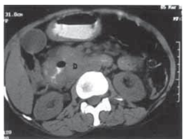
Fig-1: Contrast- enhanced CT scan of abdomen showing concentrically thickened duodenum compressing the adjacent structures, distended gall bladder and dilatation of extra-hepatic biliary channels

Arbor stage I_{\rm E} /Lucano stage I) was made. Patient refused any further therapy.