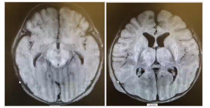
Fig-1: MR imaging of brain T2/flair axial sections showing signal intensity changes bilateral in the globus balledi, thalami and the midbrain and mild atrophic brain changes)

Admitted to PICU connected to cardiopulmonary monitoring, full septic screening done treated with cocktail therapy biotin, thiamin, L-carnitin and Co enzyme Q10. Second day she is deteriorated: bradypnea RR: 10, HR:155. Connected to Mechanical Ventilation. With no improvement and AFTER multidisciplinary team meeting was conducted (metabolic, neurology, PICU and primary team) they decide: DNR, Labs PRN.