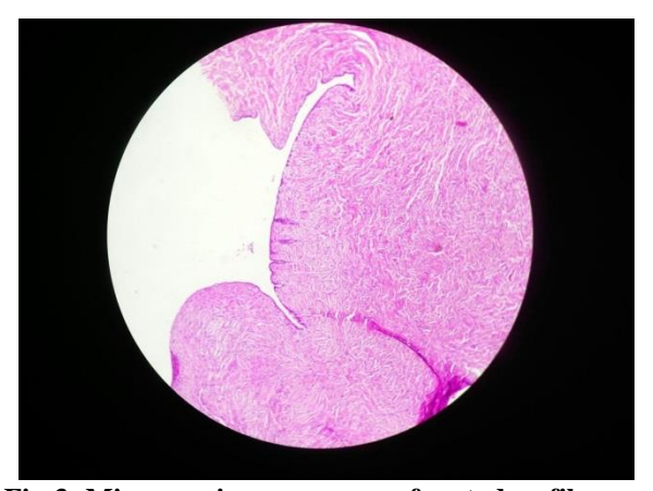
Fig-3: Microscopic appearance of cystadenofibroma