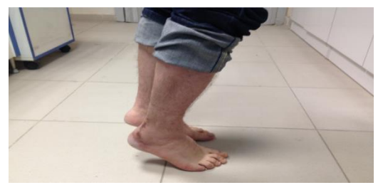
Image-5: The patient was able to rise to the tip of the toes on the 6th postoperative month

the first year, the AOFAS score was 77 and painless full ankle ROM with good triceps surae muscle strength was detected. The patient could rise to the tip of his toes (image 5). At the end of the second year the AOFAS score increased to 86.