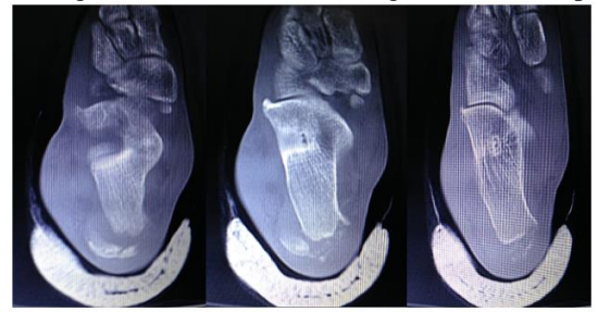
Image-2: Axial CT image of the ankle. An atypical multi-fragmented calcaneus avulsion fracture

A large multi-partial avulsed fragment was seen on the image, and CT was performed (image 2).