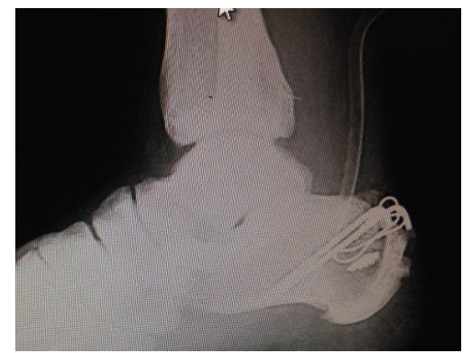
Image-3: Satisfactory anatomic reduction can be seen on the first postoperative day

The fracture was stable, and the passive ankle dorsiflexion and stability were not impaired. The crumbled bone fragments were fixated to the main fragment by using anchor spines. The plane was imaged with a scope and found to be suitable. The skin was closed, and the ankle was wrapped in long leg plaster in neutral (image 3).