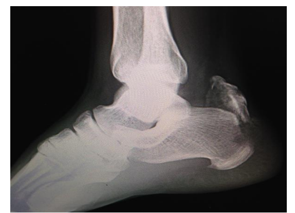
Image-1: Multi-fragmented and displaced calcaneal tuberosity fracture

A large multi-partial avulsed fragment was seen on the image, and CT was performed (image 2).