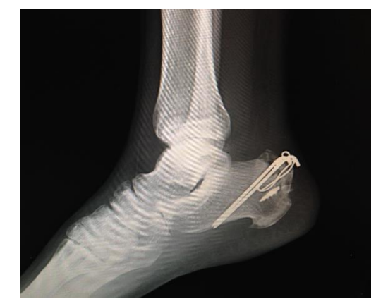
Image-4: A satisfactory healing in the lateral ankle graph at the twelfth postoperative week

removed and passive ankle movements were initiated. At the twelfth week, radiological union was observed and active ankle movements could begin (image 4).