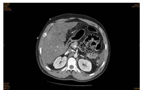
Fig-2: CT scan showing good opacification of vascular axe