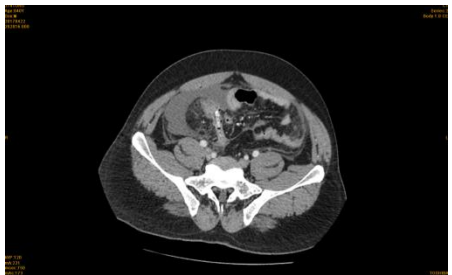
Fig-3: CT scan showingappendicealabscess