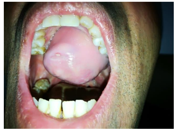
Fig-1: Clinical photograph showing the intraoral swelling on the palate