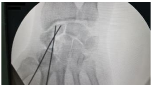
Fig-5: Radioscopic control of the wrist face fixed by two pins