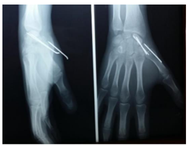
Fig-6: Standard radiograph of the right wrist: face and profile showing the migration of the osteosynthesis material

We noted in our series two patients who developed algostrophy or complex regional pain syndrome (9.5%), whose evolution was favorable under medical treatment with a well-conducted rehabilitation. We noted a case of migration of osteosynthesis material without displacement.