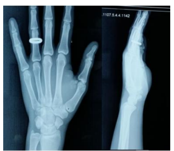
Fig-1: Standard radiograph of the right wrist: face and profile showing pseudarthrosis of scaphoid stage IIA

Conventional radiography was the first examination performed to confirm nonunion. The fracture of the carpal scaphoid in our series according to the Schernberg classification was of type II in 7 cases or 33% of cases, type III in 11 cases or 53% of cases and type IV in 3 cases, or 14% of cases. Eleven or 52% of patients had Alnot IIA-grade non-union, while 10 or 48% had Alnot IIB-type nonunion. In our series, only one patient had a CT scan showing Alnot IIB scaphoid pseudarthrosis and no patients had MRI.