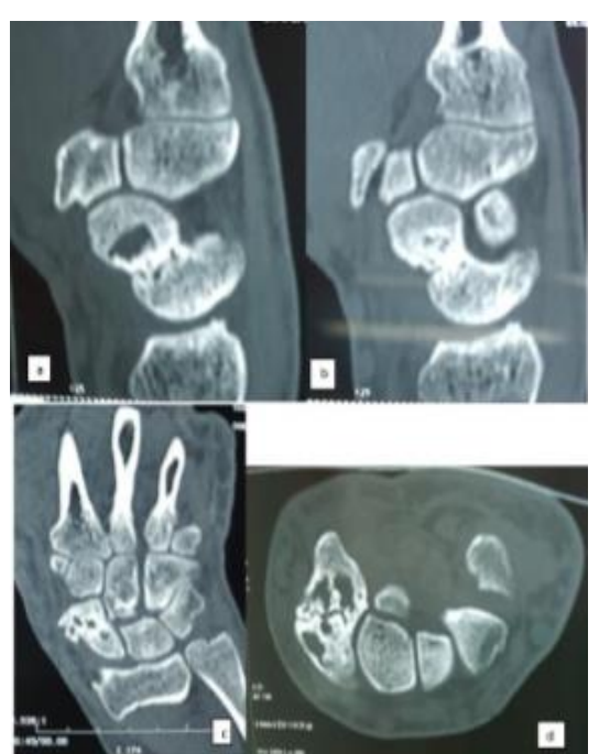
Fig-3: Scanning images of carp showing pseudarthrosis of scaphoid Stage IIB