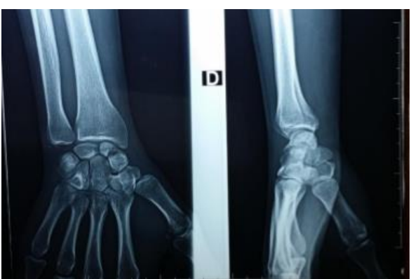
Fig-2: Standard radiograph of the right wrist: face and profile showing pseudarthrosis of scaphoid stage IIB