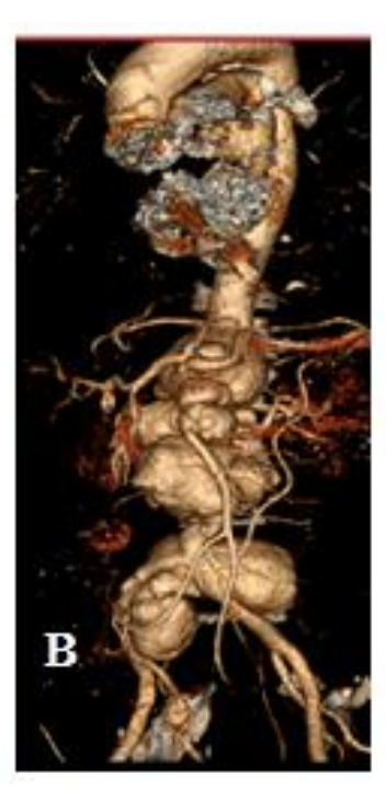
Fig-2: Multisegmental aortic saccularform aneurysms. CT angiography of the thoracoabdominal aorta. 3D reconstructions in right side view (A) and in front view (B) showant multi-stage aortic aneurysms up to primary iliac arteries

Given the appearance of computed tomography images, we have retained the diagnosis of multiple saccularform aneurysms of the thoracoabdominal aorta extended to the primary iliac arteries.