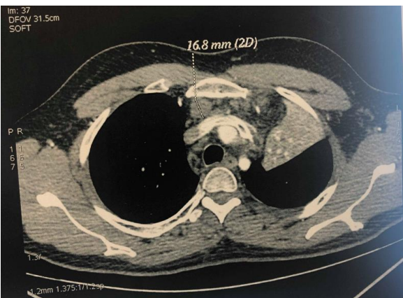
Fig-2: Chest CT scan showing a atelectasis of the left upper lobe with mediastinal adenopathies (chain 3A)

Meanwhile the abdomino-pelvic scan did not point to any peculiarity. Laboratory tests, for their part, displayed normocytic normochromic anaemia with a hemoglobin value at a level of Hb = 11g / dl and a white blood cell (WBC) count at 9600. Besides, C-reactive protein (CRP) level was at 67. The additional achieved assessments showed no abnormalities.