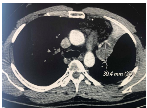
Fig-1: Chest CT scan showing a mediastino-pulmonary tissue mass with poorly circumscribed lobulated contours, encompassing the upper lobe bronchus

opacity, of an alveolar-like appearance, associated to a borderline widened superior mediastinum. Thoracic contrast-enhanced CT scan has highlighted a mediastino-pulmonary tissue mass of 33x26x27mm with poorly circumscribed lobulated contours, encompassing the upper lobe bronchus and causative of downstream atelectasis of the left upper lobe (figure1, 2). The so-called mass was associated to round mediastinal adenopathies of regular outlines, whose targets are sitting at the pre-vascular 3A nodes where they measure 18x17 mm, and at the lower paratracheal 4R nodes with 10x9mm dimentions (figure 2). The supplementary carried out C-spine CT has also shown a ganglionic relapse, as adenitis were found in the left lymph node chain IV -measuring 24x12mm- and the in the right chain III where their size is 15x11mm.