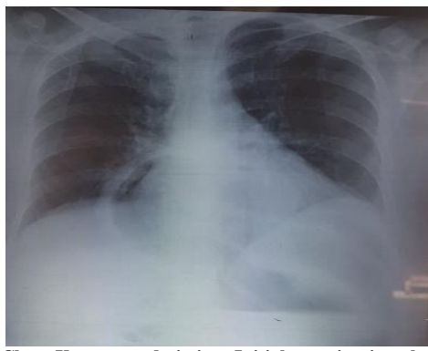
Fig-1: Chest X-ray on admission. Initial examination showed an intrathoracic mass overlying the right margin of the heart. No interstitial pulmonary edema was noted