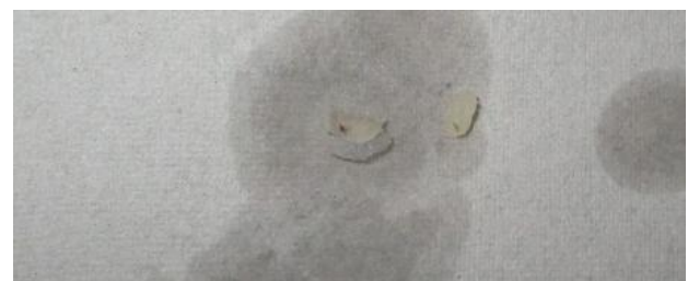
Fig-1: Gross: Two irregular, grey white, soft tissue bits

Received multiple (Two), irregular, grey white, soft tissue bit. One measures 0.4 x 0.4 x 0.1 and other tissue bit measures 0.2 x 0.2 x 0.1cm. They were called as skin tags, were pedunculated or sessile. They had either smooth surfaces. The cut surface was uniform and soft grey or pearly white.