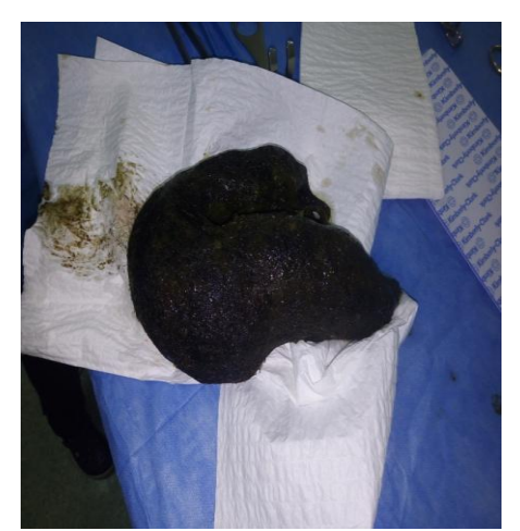
Fig-4: Surgical specimen shows the resected gastric trichobezoar

Postoperatively her recovery was punctuated only by a right-sided pleural effusion which spontaneously. The patient was discharged home on postoperative day 14 after receiving intravenous antibiotic Psychiatric treatment was started.