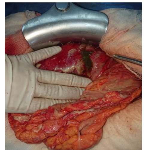
Fig-3: Perforation in lesser curvature of the stomach leaking gastric fluid.

Postoperatively her recovery was punctuated only by a right-sided pleural effusion which spontaneously. The patient was discharged home on postoperative day 14 after receiving intravenous antibiotic Psychiatric treatment was started.