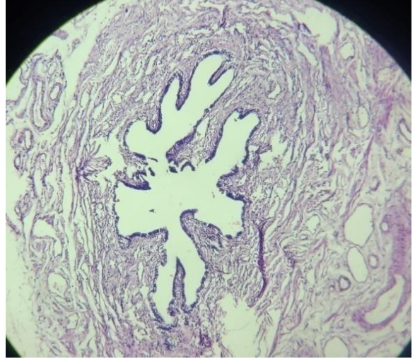
Fig-3: Sections from fallopian tube showed mucosal folds lined by pseudotratified squamous epithelium with underlying muscular wall (H&E, 100X)