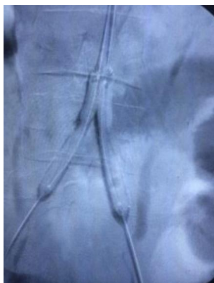
Fig-2: Release of the two stents after inflation at 14 atm