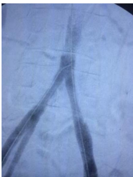
Fig-3: Angiographic control with good result