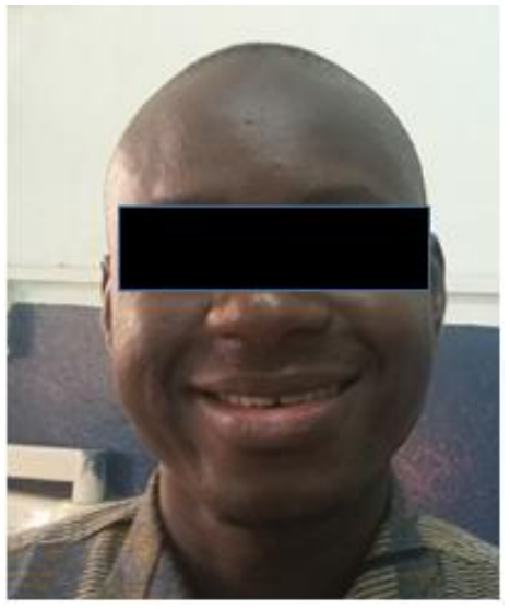
Fig-6: The smile after treatment