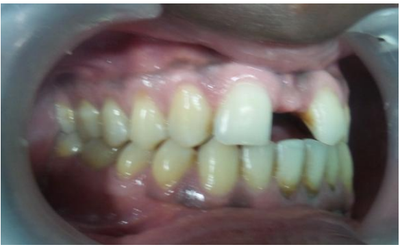
Fig-2: View before treatment