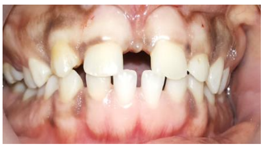
Fig-7: Before treatment

the request of the patient. The prosthetic solution which consisted in making a ceramic-metallic bridge. of 4 elements was retained. At the end of the treatment the patient was satisfied with the result obtained.