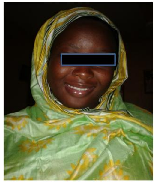
Fig-10: With a smile