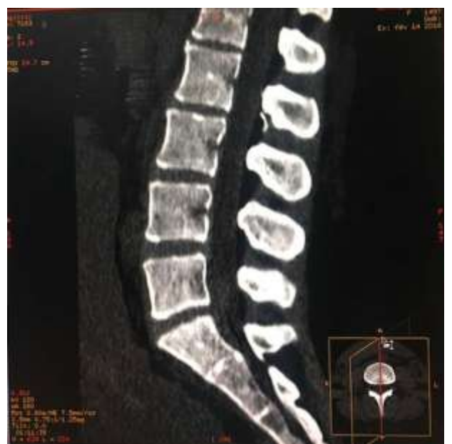
Fig-1: Lumbar sagittal CT section showing the epidural catheter as a metallically dense material between the spinous processes of L2-L3