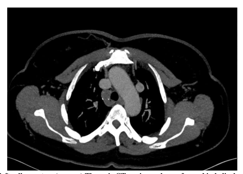
Fig-A: Double right and left cellar system (arrows) Thoracic CT angiography performed in helical acquisition with axial slices of 5 mm

This is a 64-year-old patient in whom a thoracoabdominal CT scan; this anomaly was discovered following a monitoring assessment of left breast nodule.45 yeas the physical examination on admission is normal. The electrocardiogram is without abnormalities. The chest x-ray showed a left middle arch in double contour. CT confirmed the diagnosis of PVCSG. Furthermore, the thoracic aorta was normal in these different segments.