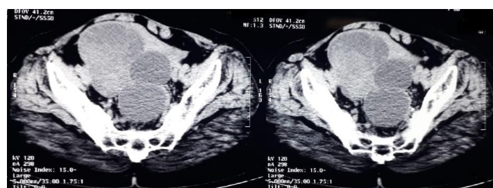
Fig-1: CT scan of the abdominopelvic mass measuring 17x12 cm

The patient underwent a median laparotomy with a voluminous mass in the right ovary measuring 30 x 10 cm with a double component: tissue and cystic. A hysterectomy and bilateral adnexectomy were performed, with infracolic omentectomy and multiple peritoneal biopsies. The histological examination concluded to a mixed malignant müllerian tumor of the right ovary with the epithelial component: high grade serous adenocarcinoma, and for the mesenchymal component: heterologous chondrosarcomatous differentiation. The patient received adjuvant chemotherapy.