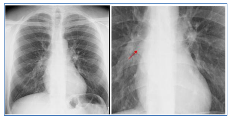
Fig-1: Chest x-ray showing a mediastinal oval mass of hydric tonality (arrow)