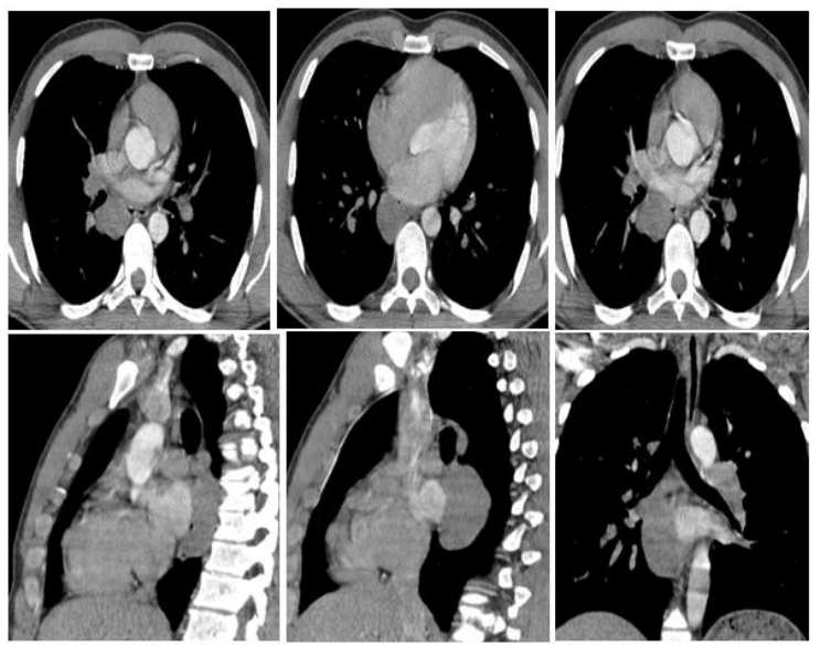
Fig-2 : Chest CT scan in axial, sagittal and coronal section showing an oval well limited cystic mass in the posterior mediastinum, with thin septations, presenting intimate contact with the esophagus, with discreet wall enhancement