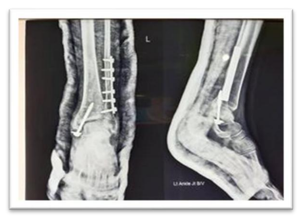
Fig-7: Postoperative x-rays (Threaded Screw)