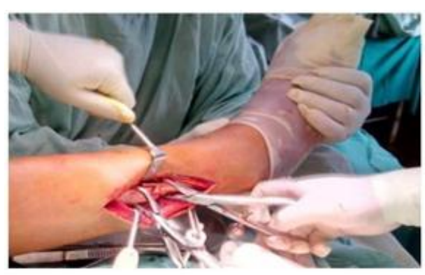
Fig-4: Fracture site exposed