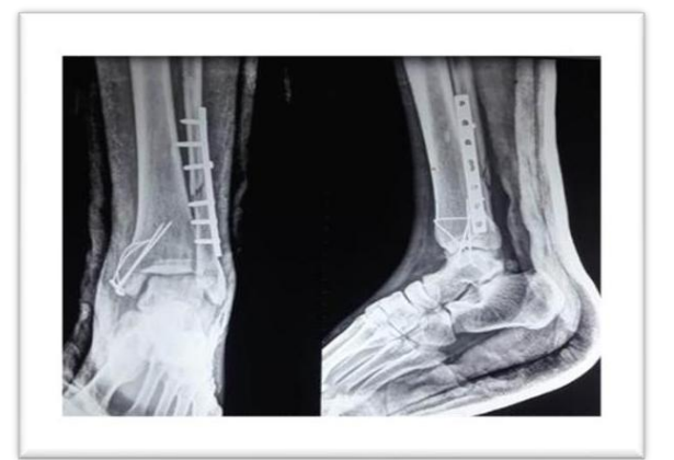
Fig-8: Postoperative x-rays (Tension band wiring)