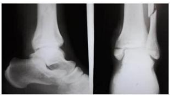
Fig-1: Pre-operative x-ray for threaded screw one third tubular plate

Pre-operative, Intra-operative, Postoperative and Follow up Figures