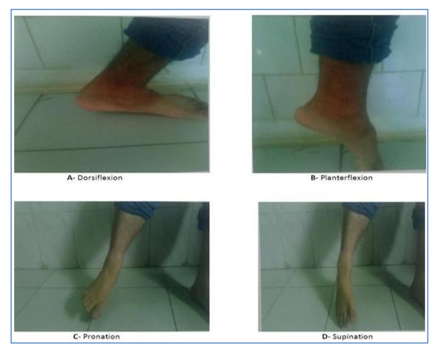
Fig-9: Threaded Screw with one-third tubular plate: ROM