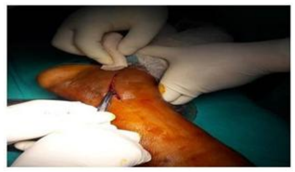
Fig-3: Skin incision