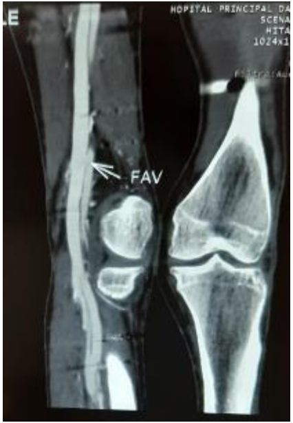
Fig-1: CT angiography of the limbs showing an arteriovenous fistula between sus articular popliteal artery and sus articular popliteal vein

Open surgery was performed in all patients. General anesthesia was performed in 3 patients and the other four underwent locoregional anesthesia. An intraoperative arteriography was performed in a single